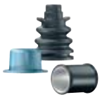
Special Sealing Products